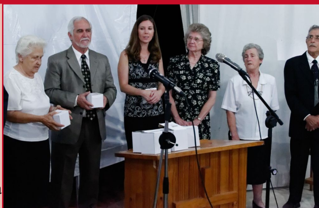
Uruguay FWB 50th Year Celebration